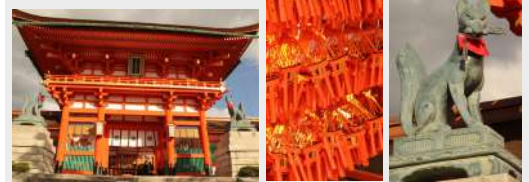
Fushimi Inari Shrine